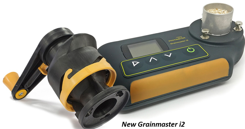
New Grainmaster i2